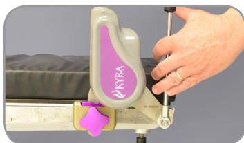
ELIMINATES DANGEROUS PINCH HAZARDS