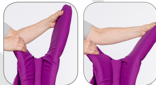
FLEXIBLE BOOT ACCOMMODATES DIFFERENT LEG SIZES