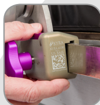
NO MORE LOST CLAMPS! OPTIONAL INTEGRATED CLAMP