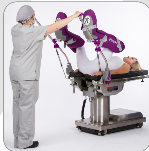
KYRA COMFORT STIRRUPS HIGH/LOW LITHOTOMY