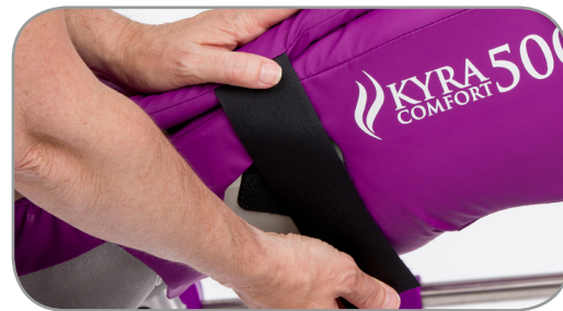
KYRA COMFORT STIRRUP WITH TRADITIONAL STRAPS